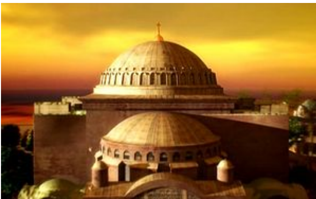
The Hagia Sophia.

—The Byzantines, who gave Russia its Christianity, had a codified Roman-based law. Why did that not translate to Russia?