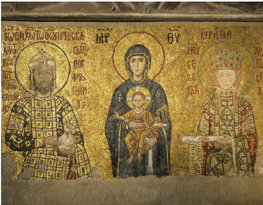
Emperor John II Comnenus and Empress Irina, before the

—In our fallen world, the more possibilities we have, the more temptations there are. People of every age and society will find ways to abuse their society's unique possibilities. The people of Byzantium also understood the danger of tyranny very well, and they tried to balance this power with the Church, with advisors and governors from all levels of society, and with norms of social life. An emperor couldn't just act on his whims. Critics of Byzantium often characterize the power of the emperor as a dangerous tyranny, but that isn't the whole story; there were also unique and attractive elements of this system.